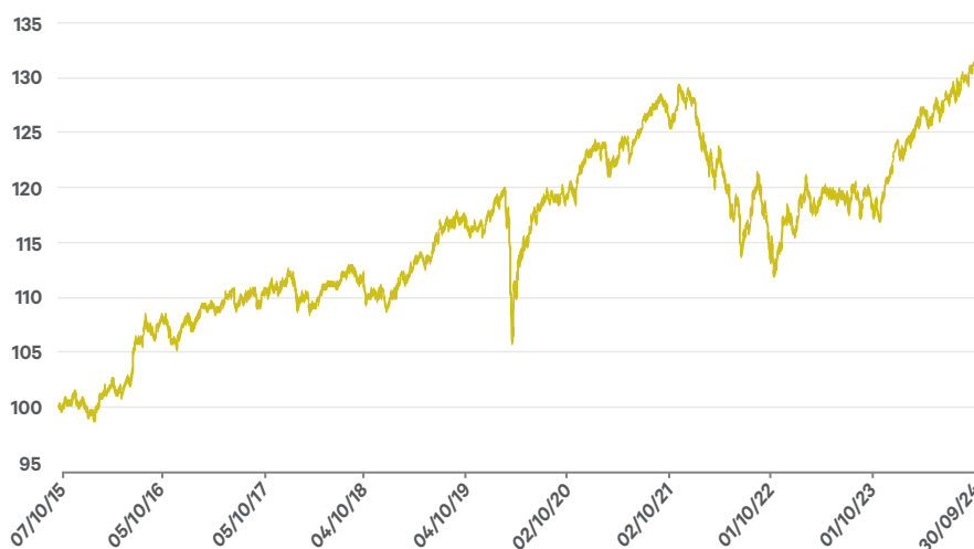
Figure 1: Performance of Davy UK GPS Cautious Growth Fund at 30 th September 2024

Warning: Past Performance is not a reliable guide to future performance. The value of your investment may go down as well as up. This product may be affected by changes in currency exchange rates.